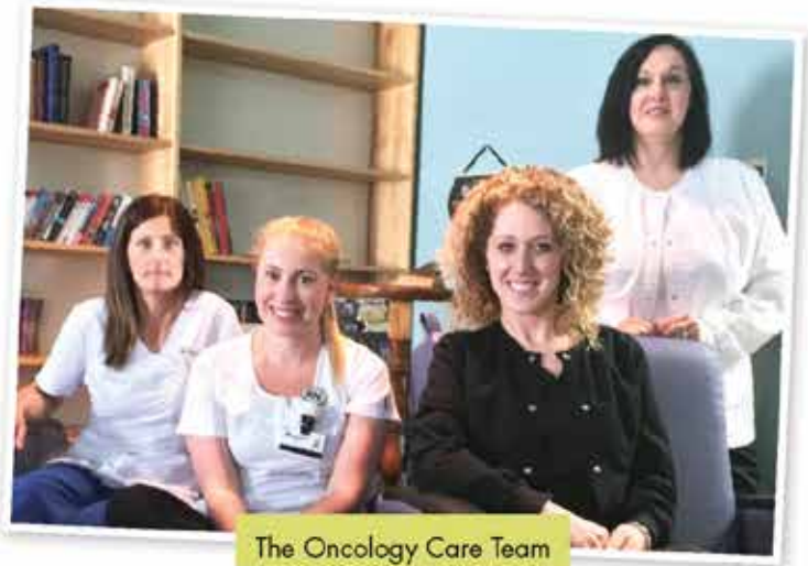
The Oncology Care Team

"The sleeper chairs have made such a positive impact to patient care by providing a comfortable sleeper bed to support family members staying overnight with their loved one. This was a very special and meaningful gift for our cancer patients and their families."