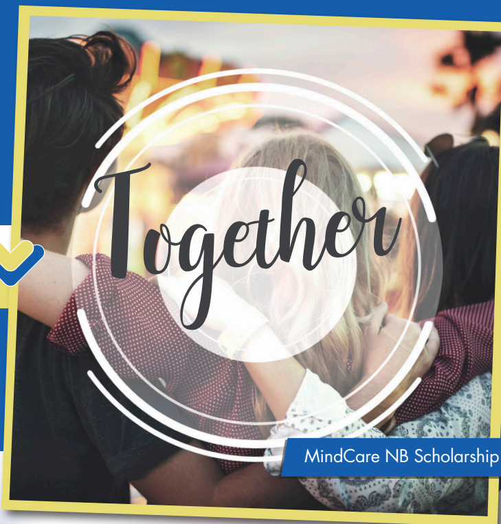
MindCare NB Scholarship

Cleveland Clinic - Communicate with Heart Frontline Training Program Franklin MindCare Scholarship – St. Thomas University NB Heart Centre 29th Cardiovascular Symposium NB Professional Diabetes Educators Conference 2019 New Brunswick Hematology Day 2019