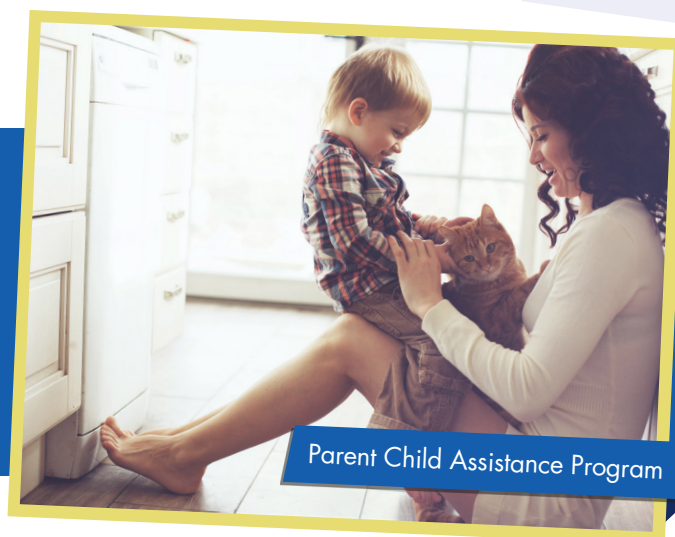
Parent Child Assistance Program

Phase II and III - Transforming Access to Psychological Care SOAR (Medical and Health Research Fund) Fundy Foot and Ankle Centre Parent Child Assistance Program NB Social Pediatrics – Assessment Clinic NB Social Pediatrics – Strengthening Families Program